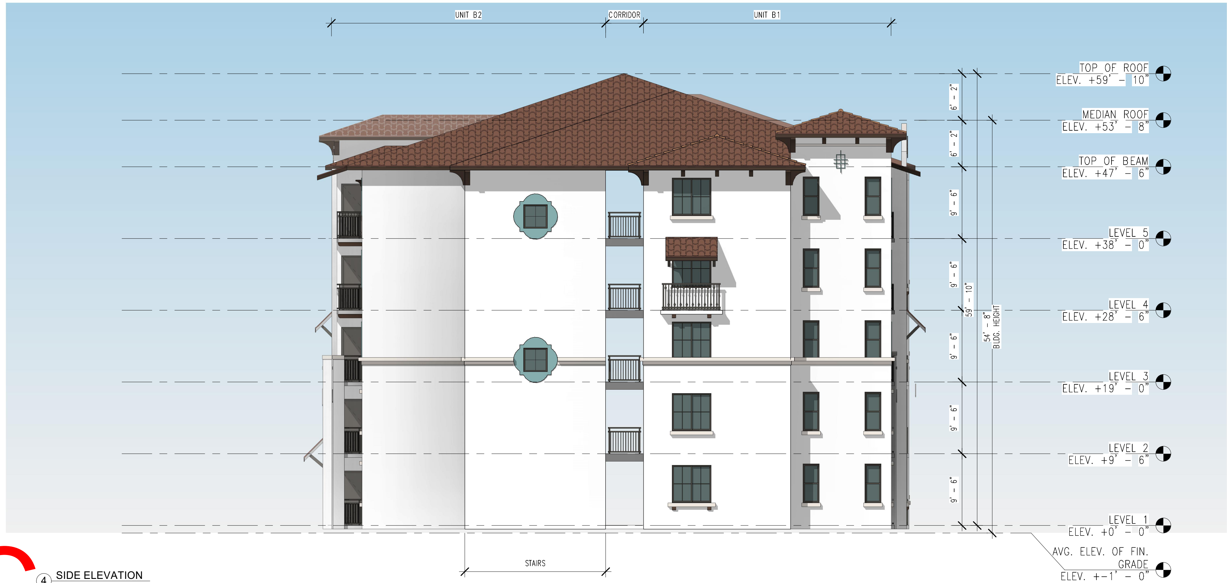
④ SIDE ELEVATION 1/8" = 1'-0"