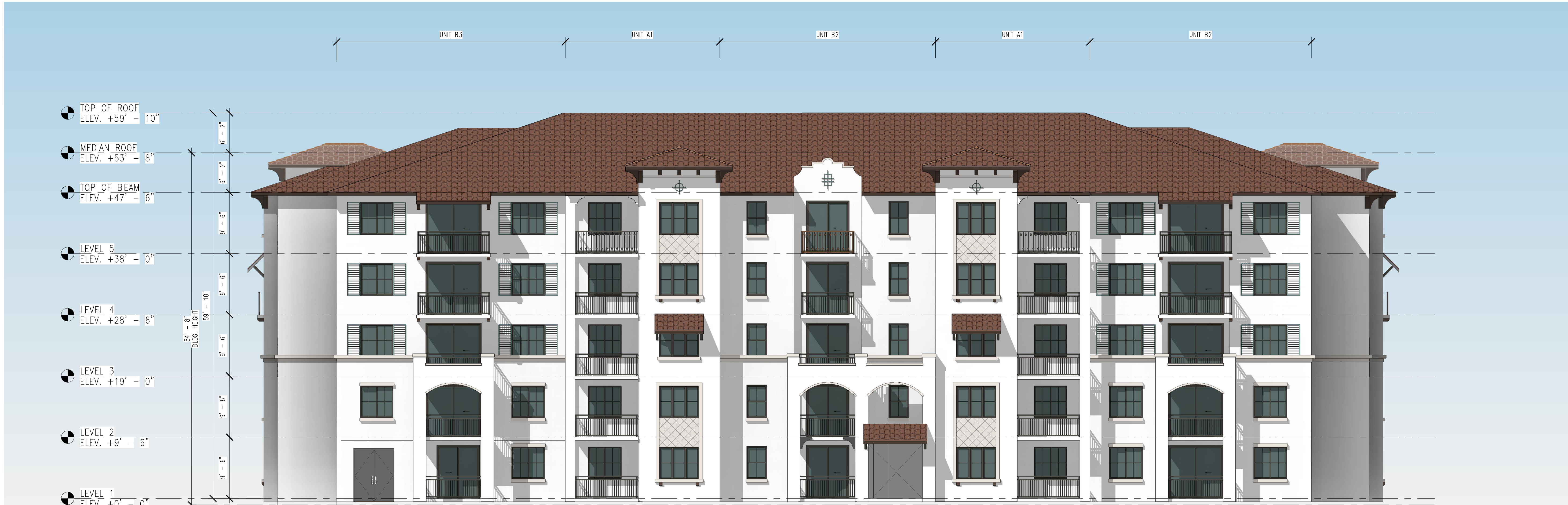
② BACK ELEVATION 1/8" = 1'-0"